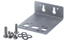
-K DP- wall bracket CODE RB7400021