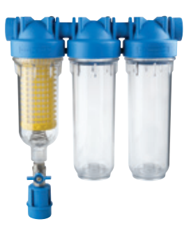
-TRIO RLHtriple stage