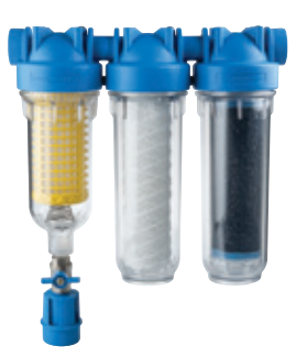
-RAINMASTER TRIOtriple stage RLH+FA+LA