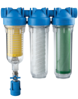
-RAINMASTER TRIOtriple stage RLH+FA+CB EC