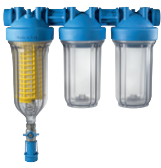
-BIG TRIO RLHtriple stage