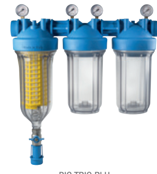
-BIG TRIO RLHtriple stage with 4 gauges