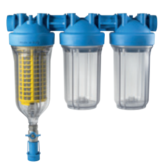
-BIG TRIO RAHtriple stage