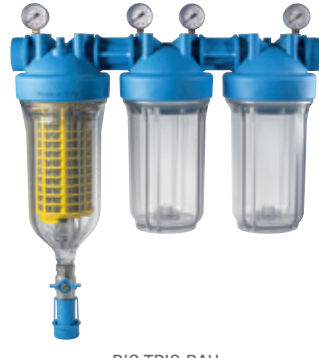
-BIG TRIO RAHtriple stage with 4 gauges