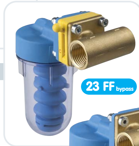
23 FF bypass