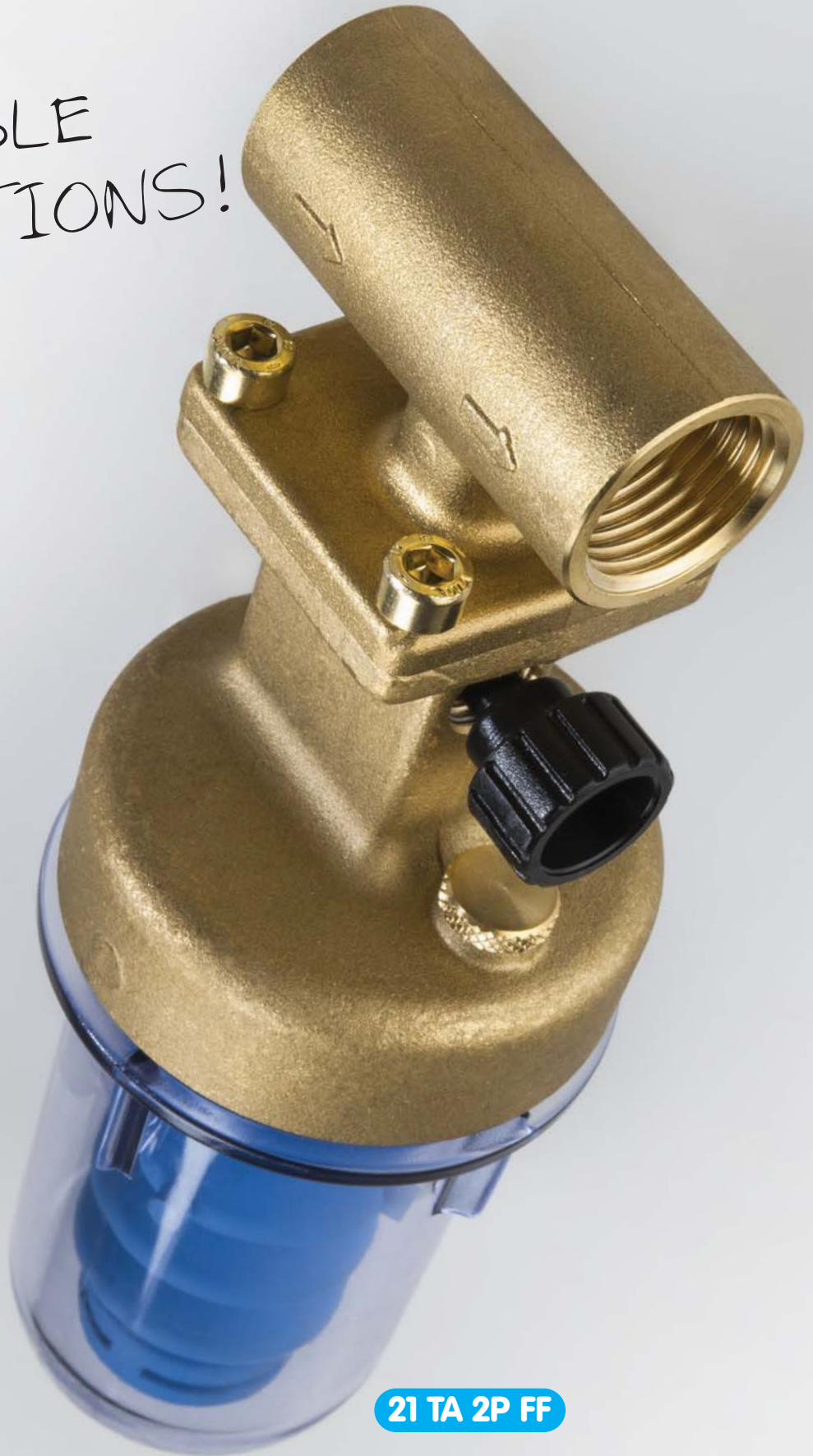
21 TA 2P FF

Non-toxic materials, suitable for drinking water. Head: CW 602 N brass. Bowl: SAN. O-ring: EPDM. Breather-valve: body stainless steel, o-ring EPDM. Bellow: rubber (NBR). IN/OUT threads: CW 614 N brass, 1/2" BSP