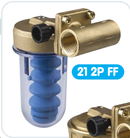
21 2P FF