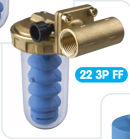
22 3P FF

Non-toxic materials, suitable for drinking water. Head Dosapulus 21: CW 602 N brass. Head and ring nut Dosapulus 22: CW 602 N brass. Bowl: SAN. O-ring: EPDM. Breather-valve: body stainless steel, o-ring EPDM. Bellow: rubber (NBR). IN/OUT threads: CW 614 N brass, 1/2" BSP