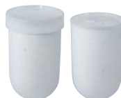
2 Poliphos A charge for Dosaplus