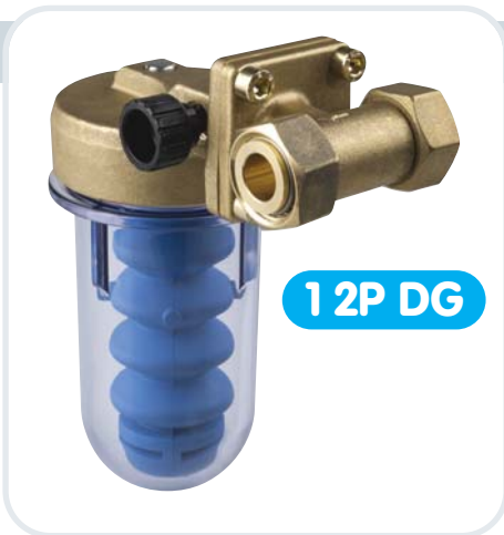
1 2P DG