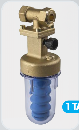
1 TA 2P DG